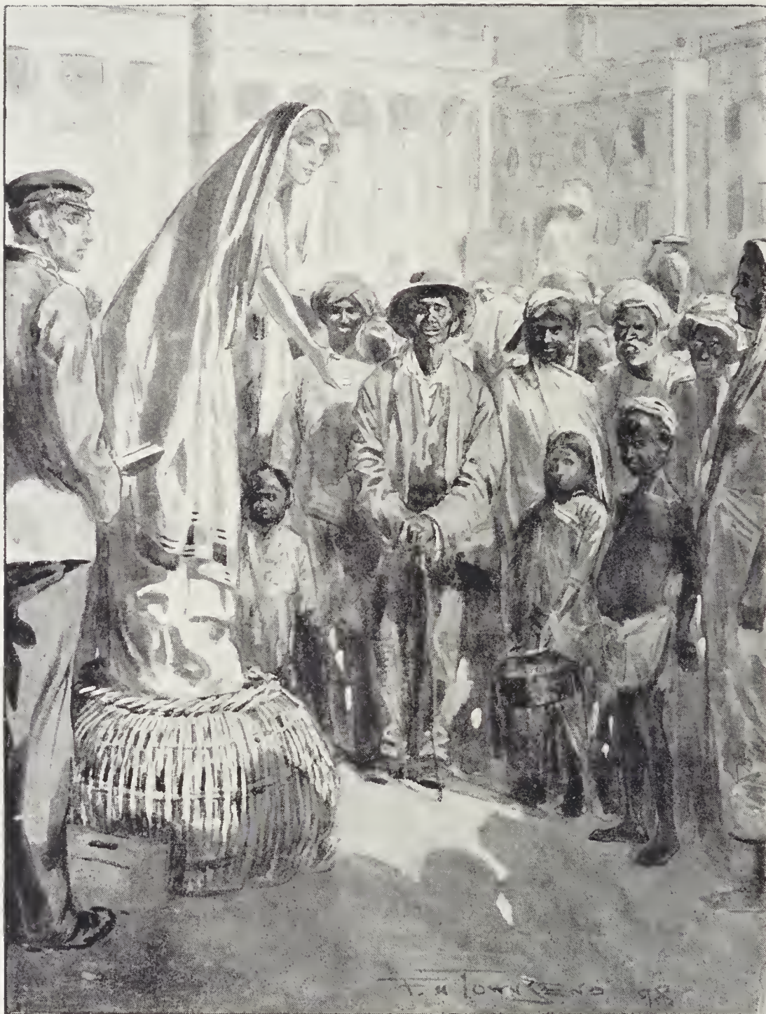
SHE STOOD POISED ON A COOLIE'S BASKET IN THE MIDST OF A RABBLE OF ALL COLOURS